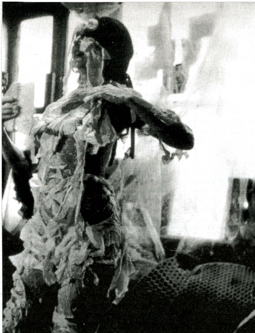
Carolee Schneeman performing "Body Collage" in her loft on West 29th Street, 1967.